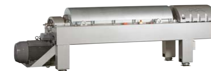
Foodec hygienic decanter centrifuge

These are backed by a full range of training and support services.