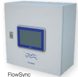
FlowSync control cabinet.

Used in conjunction with Alfa Laval's market leading S separators, Alfa Laval FlowSync provides a complete energy-efficient separation system with top certified flow rate values and Alfa Laval Alcap technology, which automatically adjusts separation performance to the nature of the fuel oil.