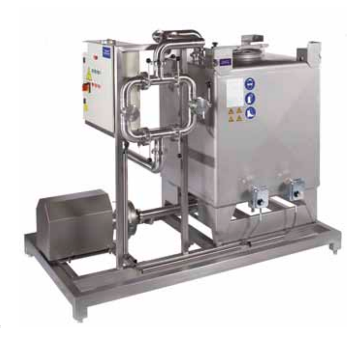
Cleaning in Place CIP 800