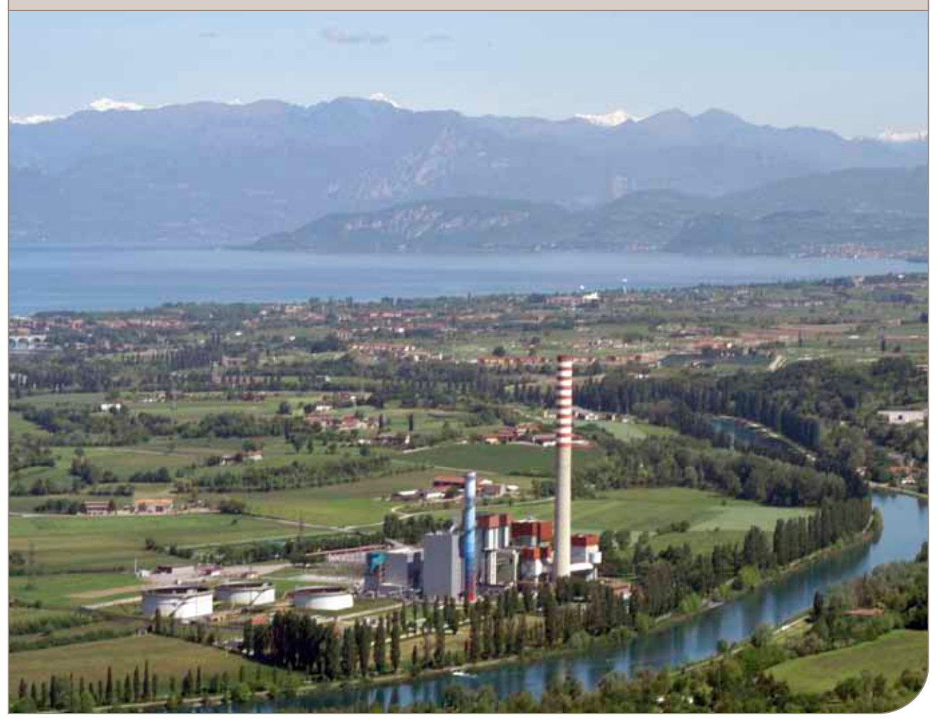
Mincio Thermoelectric Power Plant (aerial view)

A thermoelectric power plant works on a continuous cycle. Turbines, alternators and auxiliary components all have to be constantly cooled to avoid a loss of power plant output and possible damage to machinery. The heat exchangers therefore have an important role to play. The 380 megawatt Mincio Thermoelectric Power Plant, which is owned by four northern Italian public limited companies, has two Alfa Laval M30 heat