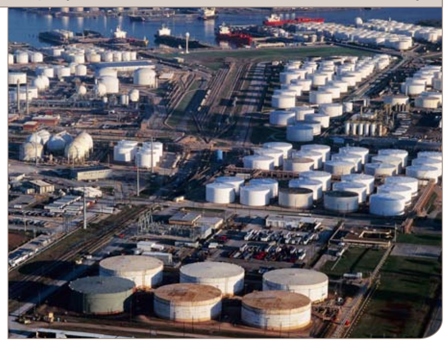
Tank terminals require efficient pumping solutions for unloading and loading products of varying qualities, in all temperatures. The customer, a molasses transshipment company in Odessa (not shown) found Alfa Laval Rotary Lobe Pumps to be the most cost-effective solution.

Increasing demand for molasses was putting pressure on the company to step up productivity. Operations consist of unloading the product from trailers and rail tank cars, storage and subsequent transferral to ships in the port.