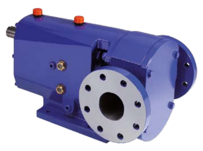
Alfa Laval DRI Rotary Lobe Pump for industrial applications