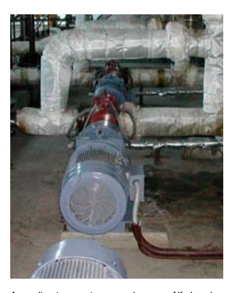
According to a customer spokesman, Alfa Laval Rotary Lobe Pumps will move molasses at a temperature 8-10°C lower than comparable pumps from other suppliers.

Rotary lobe pumps have clear advantages. They are more energy efficient, provide greater shaft torque and do not suffer from internal component wear due to metal-to-metal contact.