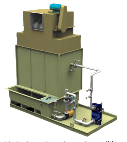
Liquid desiccant packaged conditioner

Alfa Laval reserves the right to change specifications without prior notification.